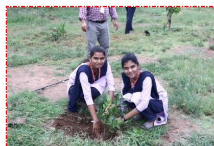
Staff and Students of PACE ITS' active participation in Meri Matti Meri Desh campaign