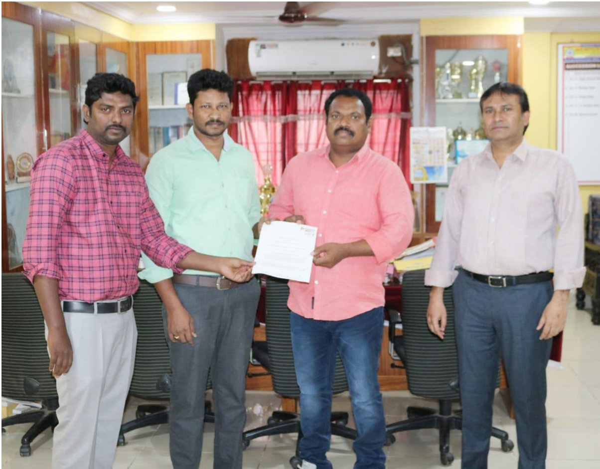
Signed up an MOU with Pantech Prolabs India Private Limited, Hyderabad in the month of October, 2021.