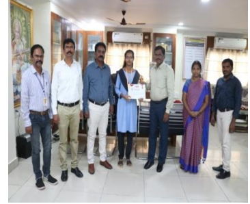
Essay Writing Winners