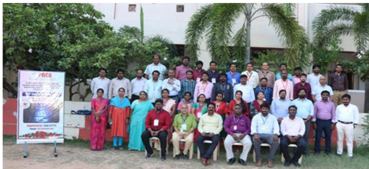
The Members of the staff from different colleges who took part in the FDP 2023