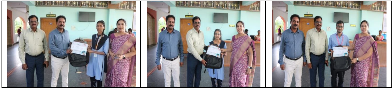
Top Coders with PACE Officials