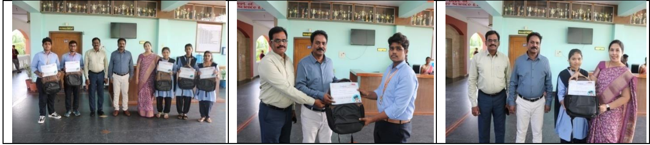
Top Coders with PACE Officials