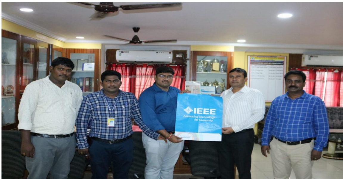
Inaugurated PACE IEEE Student branch at Pace Institute of Technology Sciences (Autonomous), Ongole on 16 th November 2021.