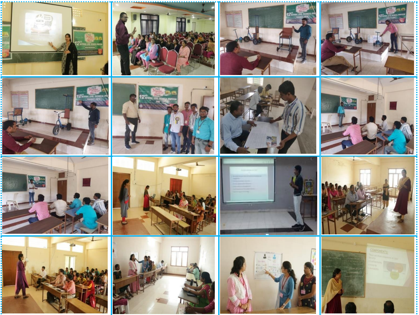
Several events held at SRUJANA 2K23 featured students from several colleges