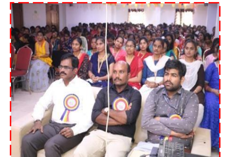
Aiming for the SRUJANA 2K23 Target