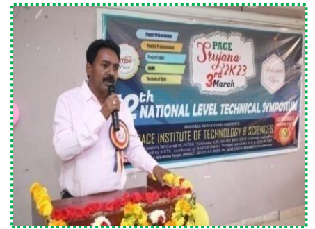
Reflections from the Luminaries