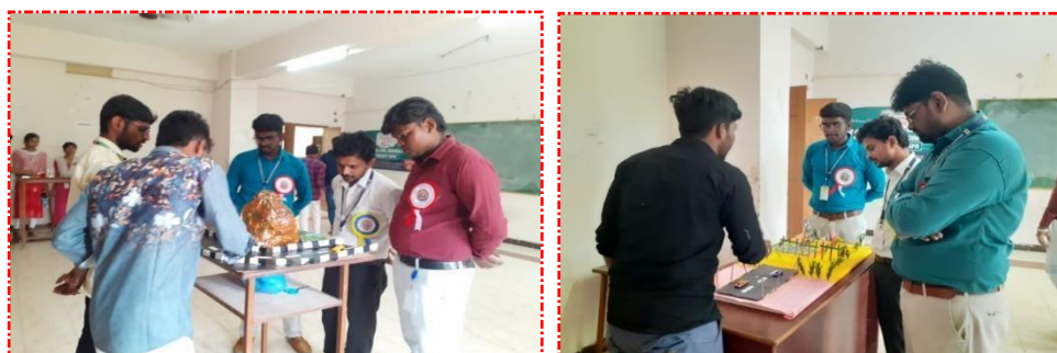
Students from Civil Engineering active participation in PACE SRUJANA 2K23 Project Expo

The department actively organized and carried out several events in honour of the 12th National Level Technical Symposium, SRUJANA 2K23 at PACE Institute of Technology and Sciences, on March 3, 2023.