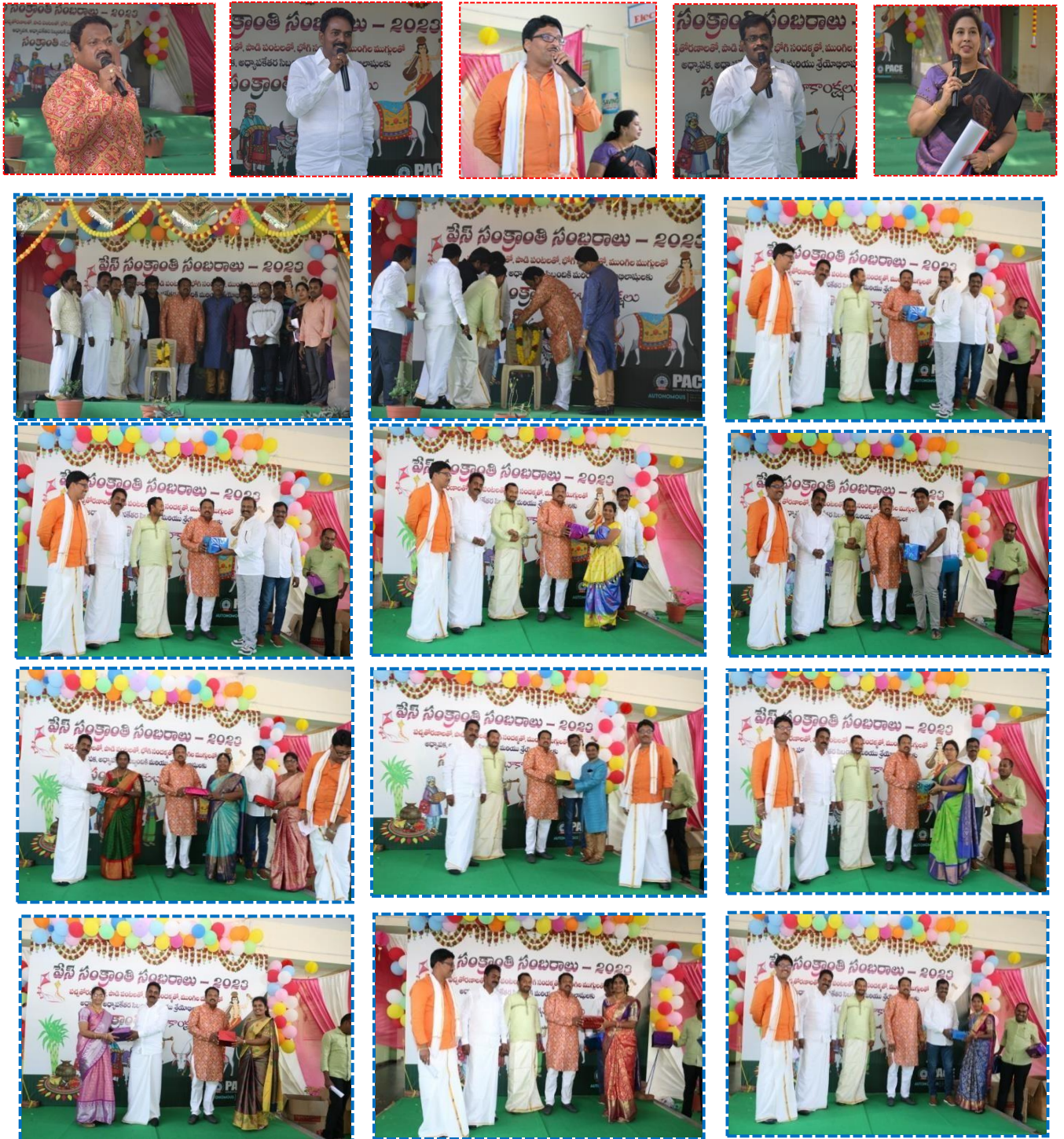
Speeches, Cultural events and Awarding Prizes at PACE

The PACE family lavishly observed the Pongal and Sankranti festivals.