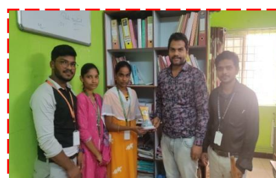
The winners receive their prizes